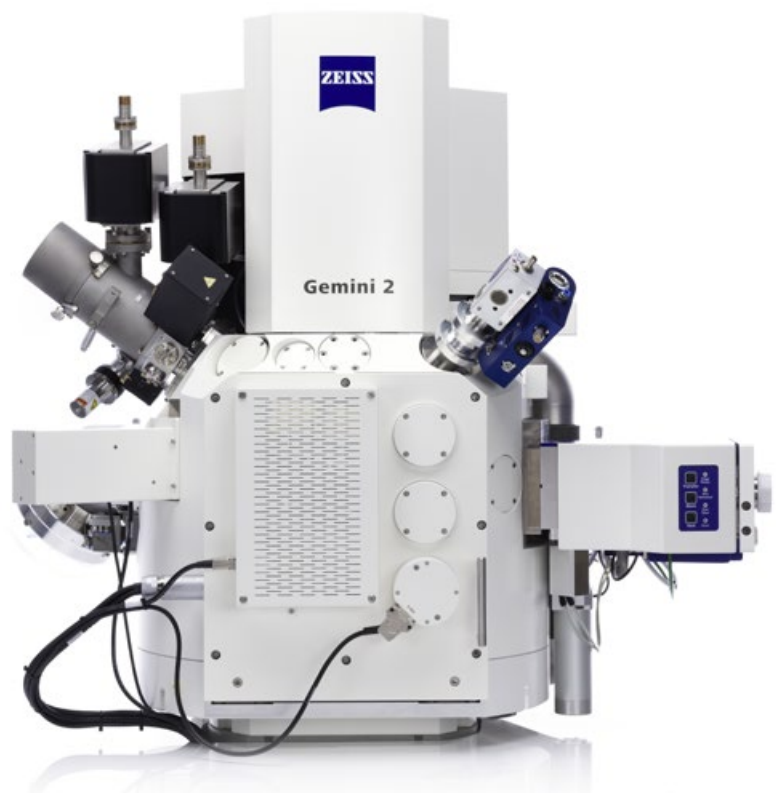
ZEISS Crossbeam for the analysis of material properties in the nanometer range.

With models such as the BMW i3 and i8, BMW Group in Munich is a pioneer in premium electric vehicles. The Munich-based company is therefore also tackling new quality assurance tasks in this context with premium standards. This is how the Technology department combines material and process analytics with several ZEISS microscope types to examine components such as battery modules and cells as well as circuit boards