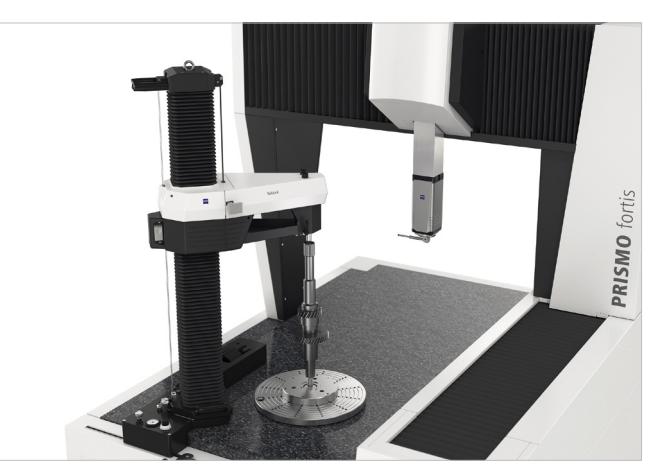
The tailstock is compatible with the ZEISS PRISMO Family and is available in two variants, perfectly aligned with the CMM sizes.

complete measurement of shaft-like measuring objects in one orientation