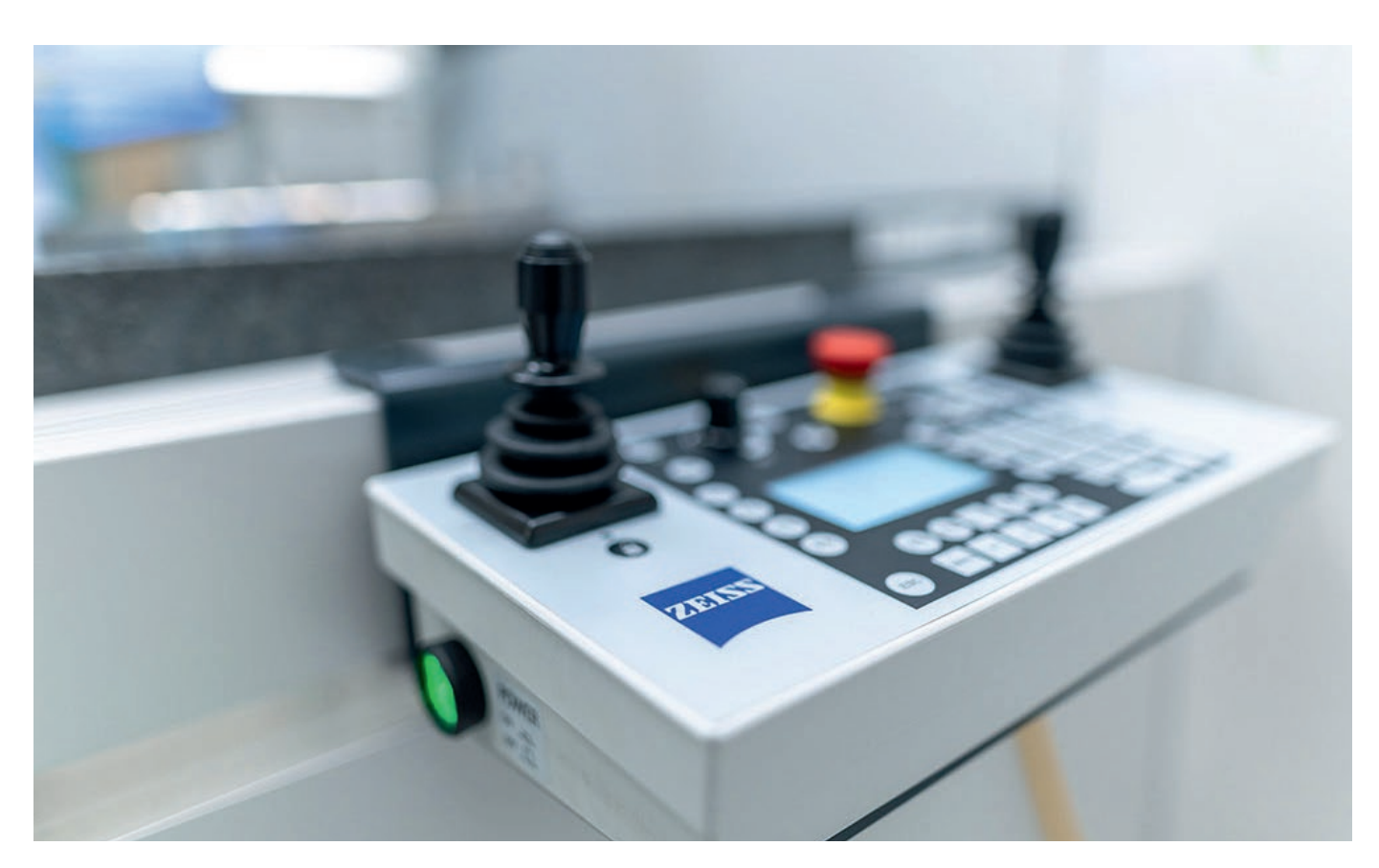
The highly ergonomic control panel is one of many user-friendly upgrades with the new ZEISS PRISMO Family

ZEISS PRISMO 7/12/7 fortis and ZEISS CMM Acceleration Mode for Aerospace Applications set up Starrag for continued longterm success in quality assurance. After all, the company is not only concerned with collecting results for a given workpiece – as Ziltener says, "we must be able to interpret the results and data" and "discuss these with our internal and external partners." This pilot project solution helps them to do just that, as ZEISS CALYPSO software promotes the easy documentation and visualization of results even by non-experts. The multi-layered approach implemented by ZEISS CALYPSO makes these features accessible to a wide array of users while also providing more in-depth options for those with greater expertise. In short, this pilot project has already helped Starrag take its quality assurance to new heights. And the company's intensive and reciprocal partnership with ZEISS offers plenty of additional potential for the future.