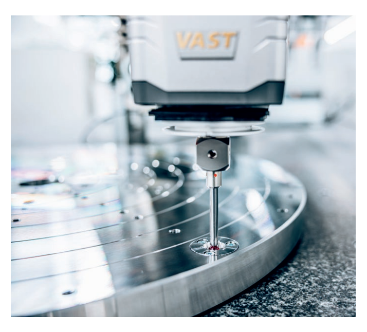
Faster positioning speed with the new rotary table of the ZEISS PRISMO 7/12/7 fortis

The new-generation ZEISS PRISMO 7/12/7 fortis boasts a highly dynamic rotary table for sharply reduced measuring times, while the ZEISS Acceleration Mode for Aerospace Applications package combines a pair of rotary table measurement options known as ZEISS VAST Rotary Table (ZVR) and ZEISS VAST Rotary Table Axis (ZVRA). These promote a fresh approach to rotary table applications by boosting the rotary table positioning speed and axis definition speed respectively. Indeed, ZVRA cuts the axis definition period from 60 to 12 seconds – a remarkable 80% time saving on a process performed for each workpiece at Starrag. The faster positioning speed also ensures that fewer styli are needed, making measurement both faster and more flexible. In terms of support, ZEISS and Starrag exchanged geometry data and worked together to identify effective contour-checking solutions that are better at handling difficult geometries. ZEISS has also made significant efforts to provide Starrag with training and support in real-world environments.