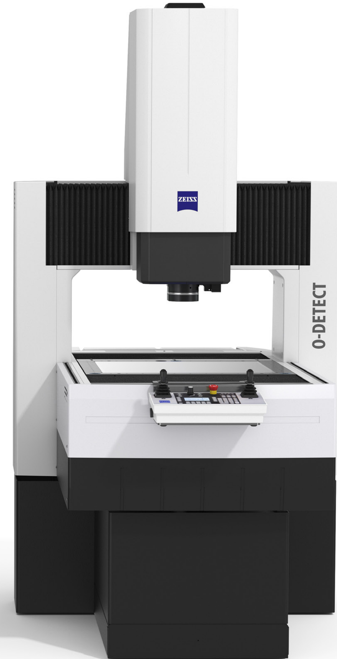
ZEISS O-DETECT 5/4/3