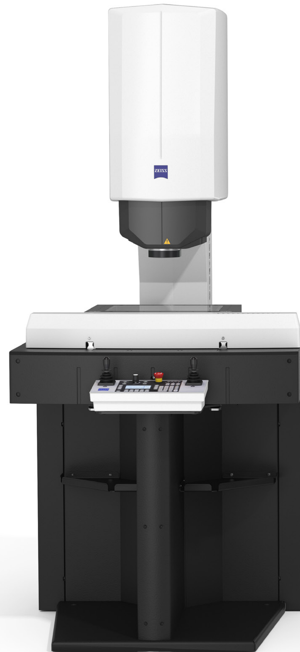
ZEISS O-DETECT 3/2/2