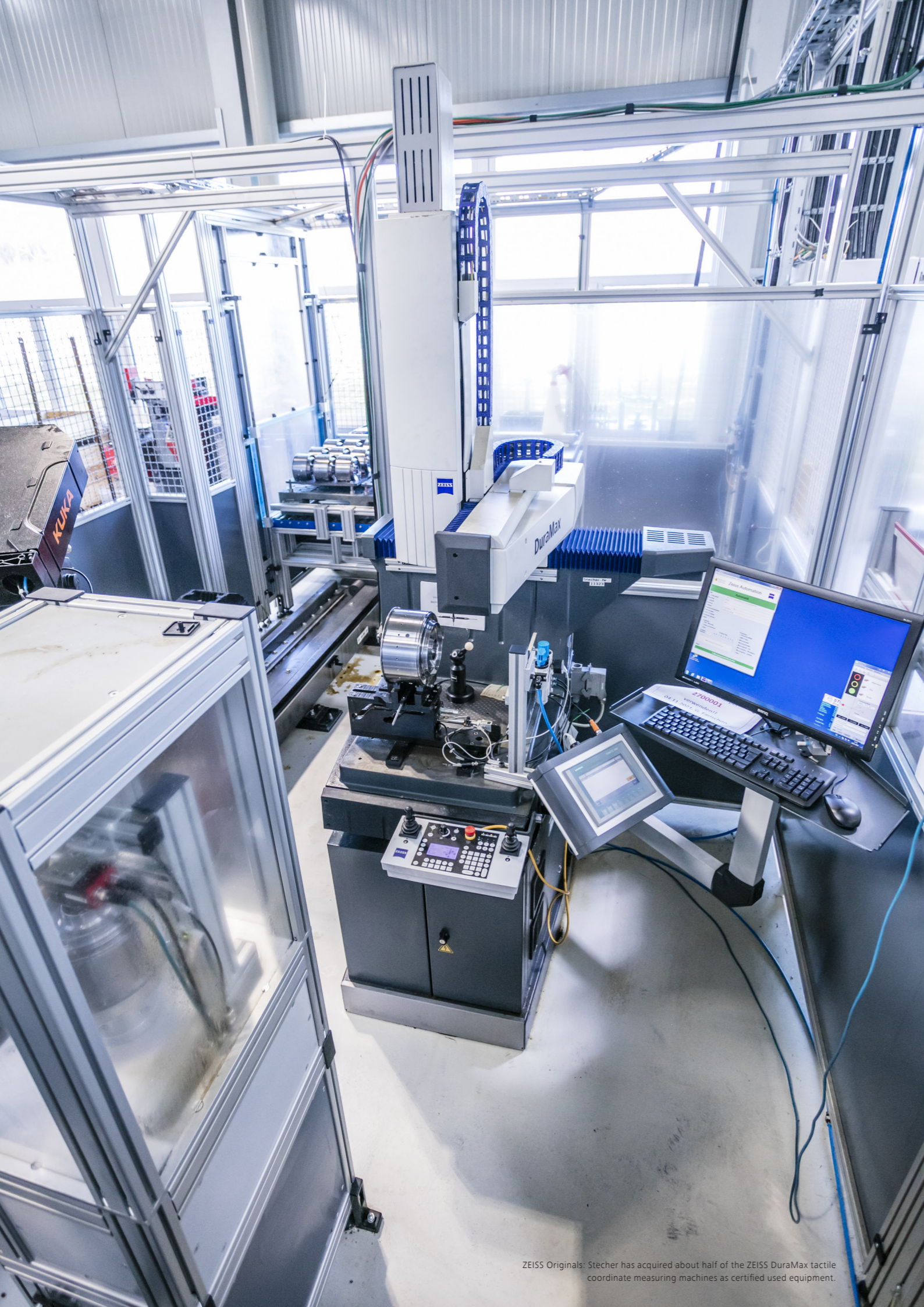
ZEISS Originals: Stecher has acquired about half of the ZEISS DuraMax tactile coordinate measuring machines as certified used equipment.