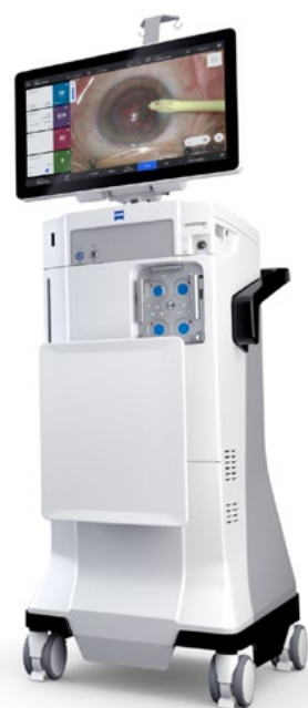
Figure 1. The ZEISS QUATERA 700

In September 2021, a new phacoemulsification system came onto the market – the QUATERA® 700 from ZEISS (FIGURE 1). Before it became commercially available, I had the opportunity to use the new device in a wet lab setting operating on enucleated porcine eyes. Then, after it was approved for human use, I used the QUATERA for 3 days at my surgery center. I will need more experience with the device before I can fully appreciate all of its features. Based on my initial limited experience, however, I can state conclusively that I was impressed by its performance for providing unsurpassed anterior chamber stability in challenging cases. Being able to work in a controlled intraocular environment made me feel comfortable and relaxed, and by the end of the first day I was looking forward to operating again with the ZEISS QUATERA 700.