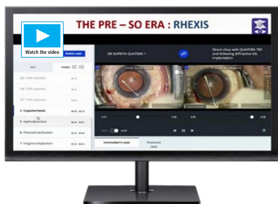
Video 2: AI driven comparison of the own surgical performance with expert-level cases