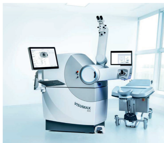
Figure 1. ZEISS VISUMAX 800

In addition, the VISUMAX 800 is physically a completely new device. As compared to the former VisuMax, the new laser has a smaller footprint and therefore needs less space in the operating room. The VISUMAX 800 is also mobile and can be relocated according to