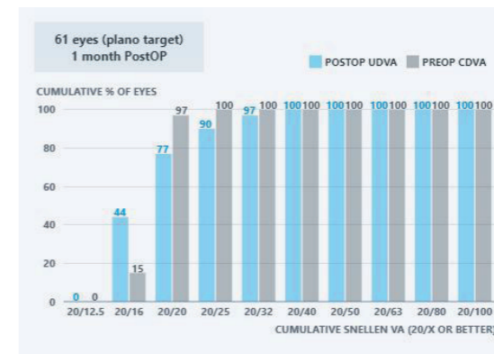
Figure 3. Scattergram showing first month post-op efficacy.

The most important factor for achieving success and patient satisfaction when performing laser vision correction surgery is to choose the right procedure for each patient. Because of its outcomes and benefits like flapless technique, Lenticule Extraction with SMILE is my treatment of choice for nearly all patients needing myopic correction with and without astigmatism.