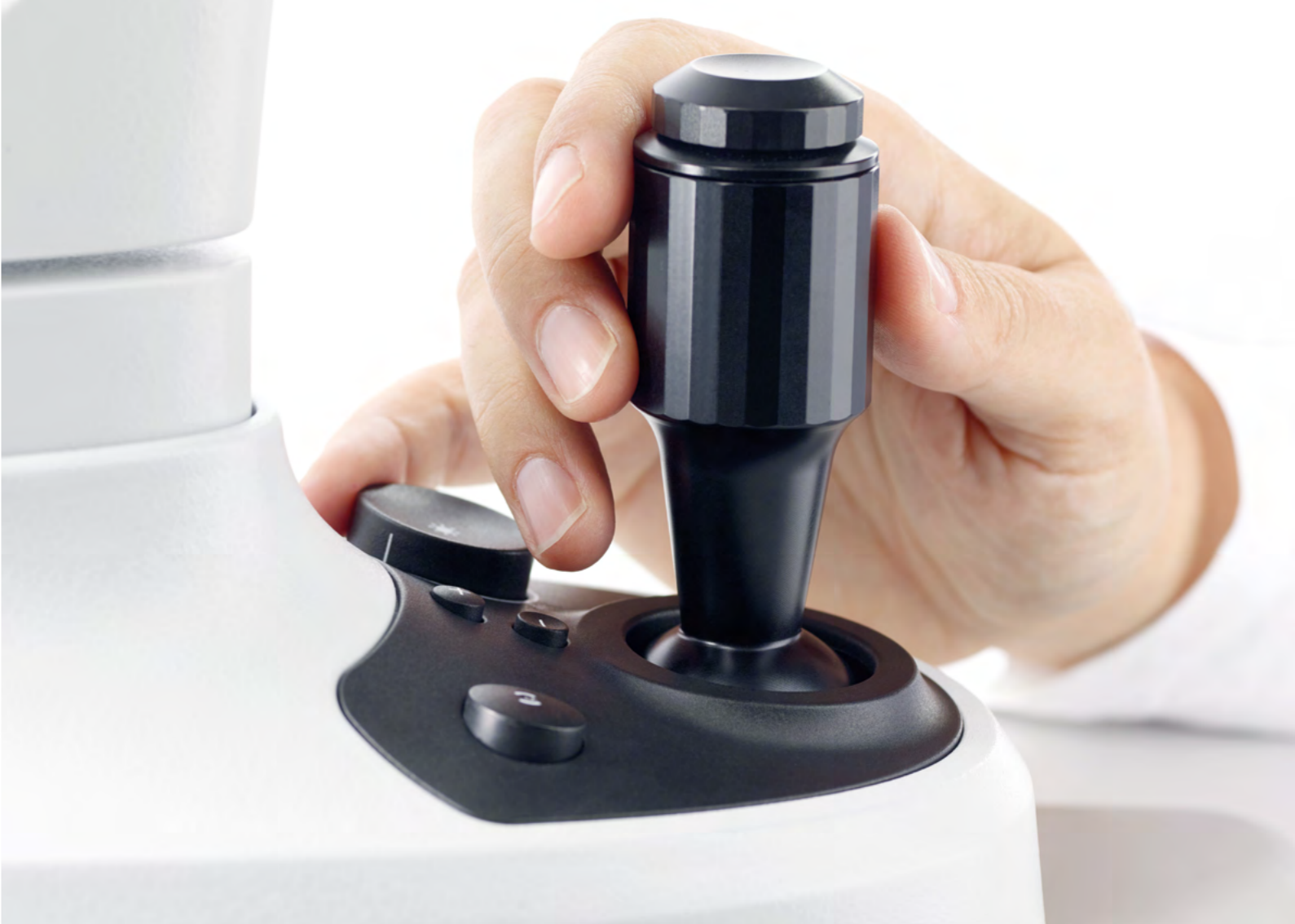
ZEISS SL 800 is optimized for one hand operation, it is equipped with AutoView, a motorized two-button mechanism for changing magnification right next to the joystick, and an electronic QuickStop brake.

“I have used many slit lamps throughout my career and the ZEISS SL 800 is the best slit lamp I’ve ever experienced. Thanks to its excellent optics, I can easily see details which are usually very difficult to see. The innovative AutoView control and QuickStop brake can be controlled with a single touch which makes routine tasks much more efficient.”