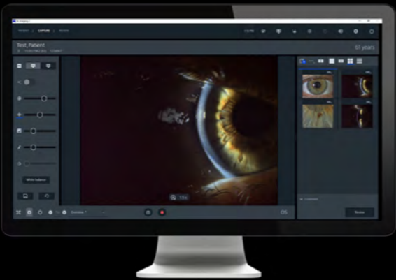
Dark Theme: In combination with the illumination of the panel PC, working in a dark environment is convenient.