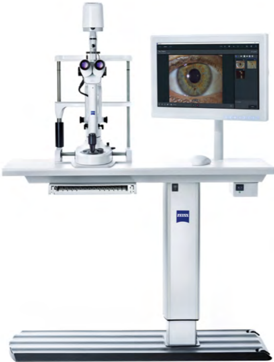
Modern design: ZEISS SL 800 & ZEISS SL Workstation