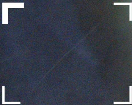
Faint corneal scars at high magnification after LASIK therapy.

New Imaging Solution for Slit Lamps from ZEISS 1