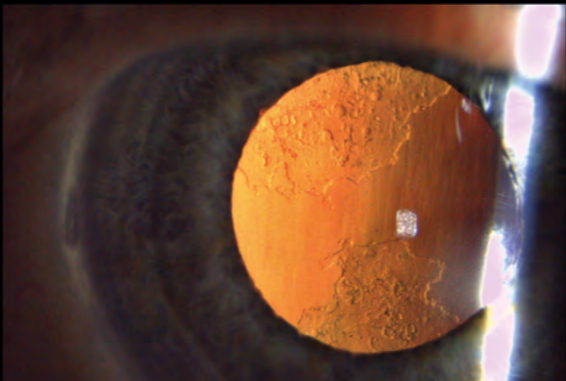
True-to-life-color: Capture as seen through the slit lamp. Posterior capsule opacification.