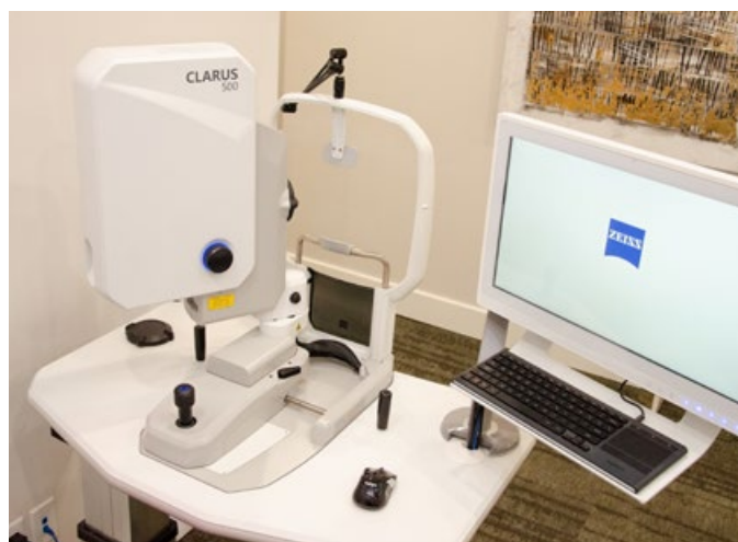
View into the examination room with ZEISS CLARUS 500