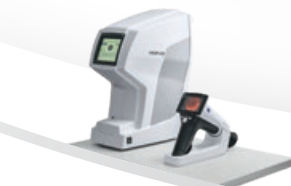
ZEISS VISUPLAN 500 tonometer ZEISS VISUSCOUT 100 retina camera

ZEISS offers a comprehensive range of refractive and screening devices for your pretest workflow. These include instruments for lens measurement, objective refraction, keratometry and corneal topography analysis.