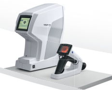
ZEISS VISUPLAN 500 tonometer ZEISS VISUSCOUT 100 retina camera

ZEISS offers a comprehensive range of refractive and screening devices for your pretest workflow. These include instruments for lens measurement, objective refraction, keratometry and corneal topography analysis.