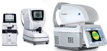
ZEISS VISULENS 500 digital lensmeter ZEISS VISUREF 100 autorefractor ZEISS i.Profilerplus 4-in-1 system

The ZEISS Essential Line devices feature comprehensive connectivity options. They enable easy data transfer and archiving, regardless of how and where you need to run individual devices, helping you to optimize your overall workflow efficiency as well as your patient throughput.