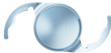
Figure 1: ZEISS AT ELANA 841P combines ZEISS trifocal technology and preferred hydrophobic C-loop platform

In September 2023, ZEISS extended its portfolio of trifocal IOLs with the launch of the AT ELANA® 841P IOL, a single-piece hydrophobic acrylic implant that offers the benefits of two time-tested technologies (Figure 1).