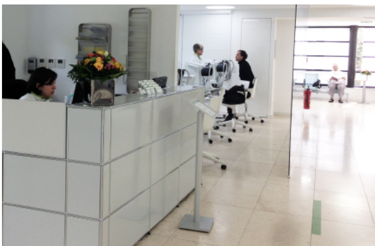
Reception and examination area for cataract patients.

So is the staff at the Dardenne eye clinic completely satisfied with ZEISS FORUM? "Not quite," says Dr. Große with a smile: "We plan to link up our four nearby medical centers as soon as possible." This will be a major move for the Dardenne if the image data from all sites is available via ZEISS FORUM.