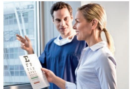
PRESBYOND Laser Blended Vision Customized. All distances. Immediate.

Laser Blended Vision LASIK performed with PRESBYOND is tolerated by a higher number of patients than conventional mono-vision – up to 97% 1 as compared to only 59–67% 2 . In many cases, patients can read without glasses the very same day.