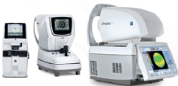
ZEISS VISULENS 500 digital lensmeter ZEISS VISUREF 100 autorefractor ZEISS i.Profiler plus 4-in-1 system

The ZEISS Essential Line devices feature comprehensive connectivity options. They enable easy data transfer and archiving, regardless of how and where you need to run individual devices, helping you to optimize your overall workflow efficiency as well as your patient throughput.