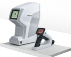
ZEISS VISUPLAN 500 tonometer ZEISS VISUSCOUT 100 retina camera

ZEISS offers a comprehensive range of refractive and screening devices for your pretest workflow. These include instruments for lens measurement, objective refraction, keratometry and corneal topography analysis.