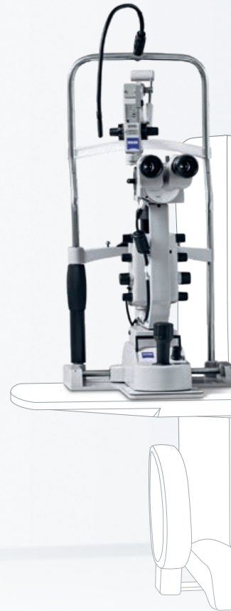
ZEISS slit lamps ZEISS SL Imaging Module

Our IOP screening and retina imaging solutions assist you in your decisions early in the process. The operation of these devices can also be delegated to medical staff, saving you valuable practice time.