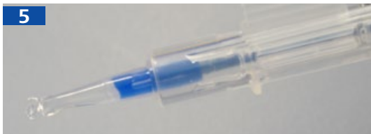
To control the release of the IOL from the tip, slow down the movement of the plunger when the optic portion of the lens reaches the beveled end of the tip.