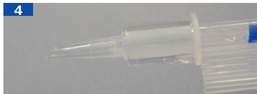
Advance the plunger until it begins to move the IOL forward and ensure that it is moving freely.