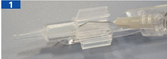
Inject OVD into the cartridge tip and along the channels.