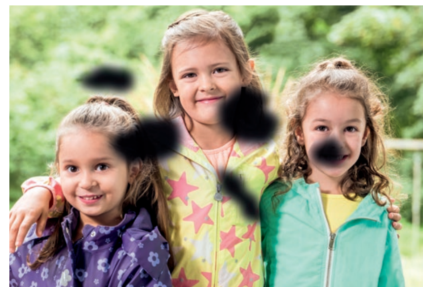
DIABETIC RETINOPATHY affects a large percentage of people with diabetes and causes blind spots.