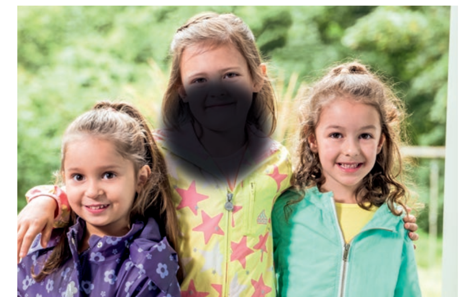
MACULAR DEGENERATION is a leading cause of severe vision loss in people over 60, affecting central vision.