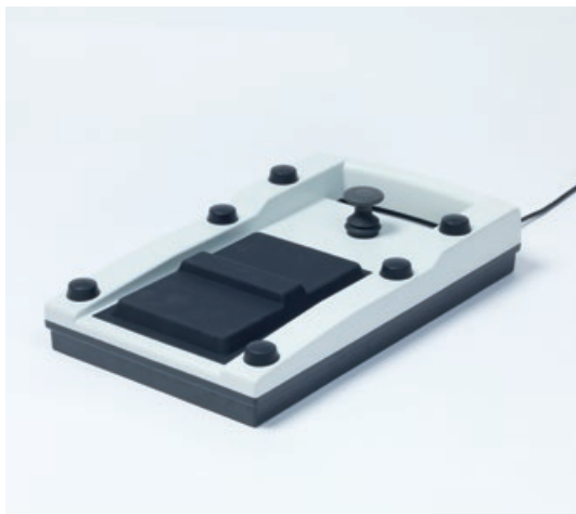
Ergonomic foot panel

And with OPTIME service packages from ZEISS extending from preventive to corrective maintenance, as well as spare parts, you can count on maximum system uptime and convenience.