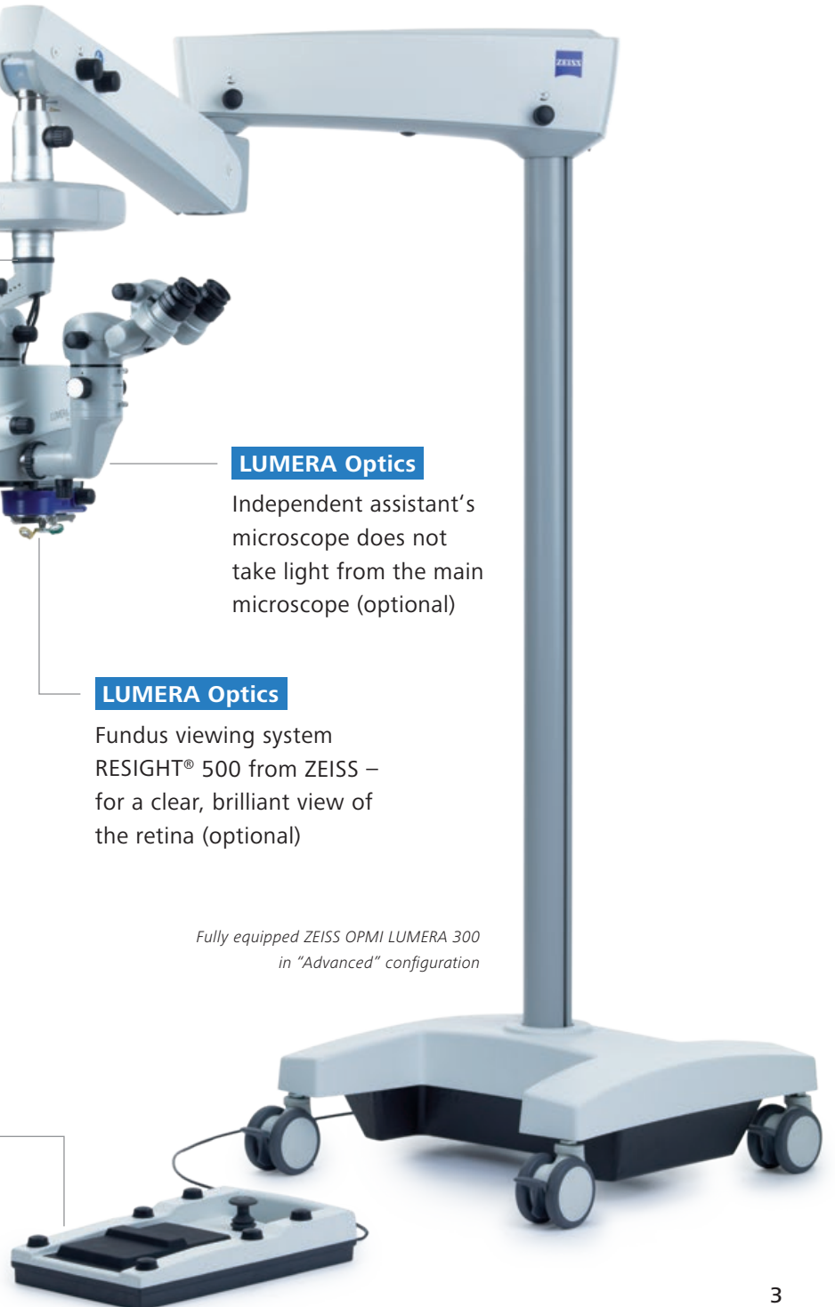
Fully equipped ZEISS OPMI LUMERA 300 in "Advanced" configuration

Ergonomic foot panel for precise control