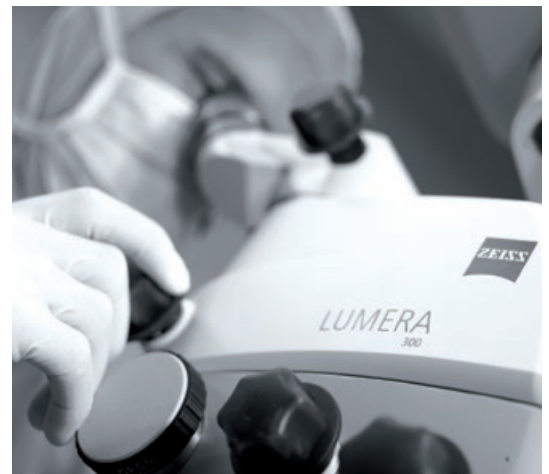
Experience outstanding quality