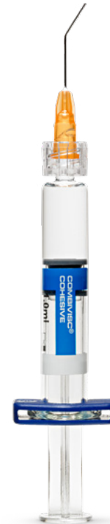
1 × Cohesive OVD 15 mg/ml, 1.0 ml