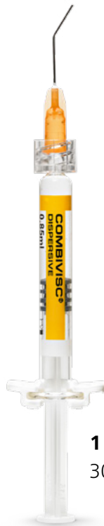
1 × Dispersive OVD 30 mg/ml, 0.85 ml