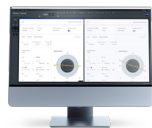
ZEISS EQ Workplace