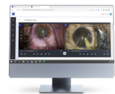
ZEISS Surgery Optimizer

AI-powered access & review of surgical video via web browser & app is enabled.*