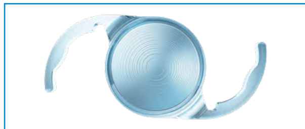
Figure 1. ZEISS AT ELANA 841P features the best of ZEISS trifocal technology on a hydrophobic C-loop platform.

The biomaterial and platform design of the AT ELANA 841P are features shared with the monofocal ZEISS CT LUCIA 621P IOL. The AT ELANA 841P is made of a glistening-free** hydrophobic acrylic biomaterial with a heparin-coated*** surface to ensure optical clarity and smooth and controlled unfolding of the IOL.