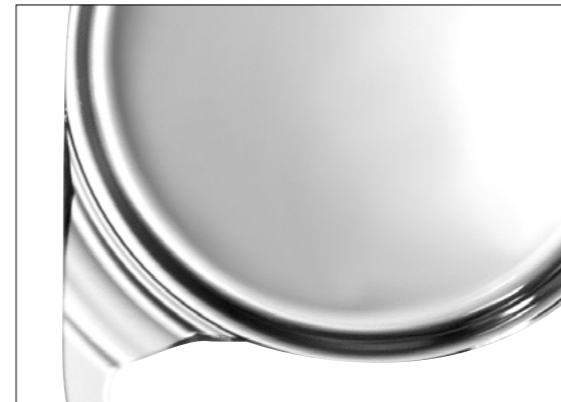
Figure 1. Schematic illustration of the CT LUCIA 621P optic-haptic junction

Unfolding of the CT LUCIA 621P IOL in the capsular bag is facilitated by its heparin-coated surface***. Yet, the lens unfolds in a gentle and controlled manner that enables its positioning. The sophisticated optic-haptic junction with its relatively rigid and enlarged step-vaulted haptics socket (Figure 1) together with the length and biomechanics of the haptics act to maintain stable IOL centration.