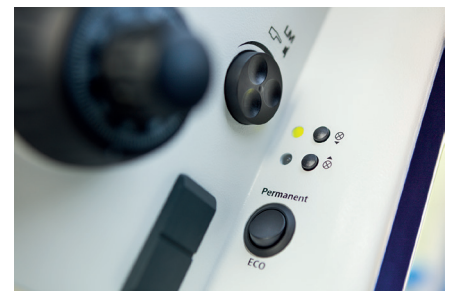
Ergonomic operating concept: Axioscope controls