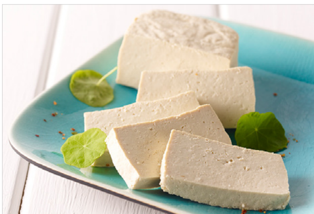
Figure 4 Tofu is free of animal fats and contains high-quality plant-based proteins and polyunsaturated fatty acids

The soybean is a very nutritious plant. It has a high protein content (38%) and contains all eight essential amino acids (isoleucine, leucine, lysine, methionine, phenylalanine, threonine, tryptophan, and valine), which the body requires for protein synthesis. In addition, soybeans consist of 15% soluble carbohydrates (sucrose, stachyose, raffinose), 18% oil, 14% water and ash, and 15% dietary fiber.