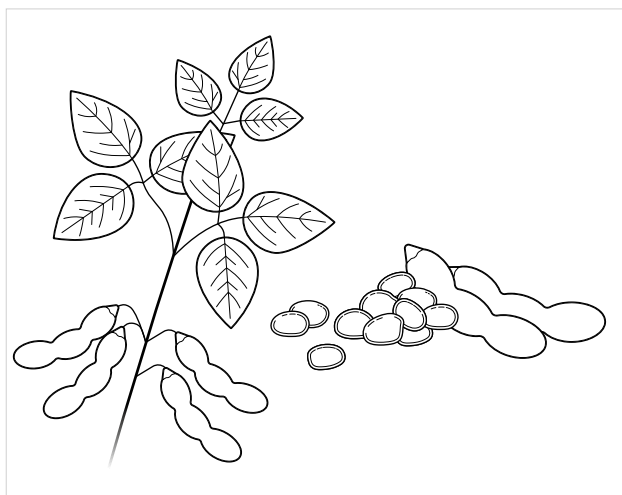
Figure 1 Soybean plant

The United States, Brazil, Argentina, India, and China are the main countries that grow soybeans. The United States is the