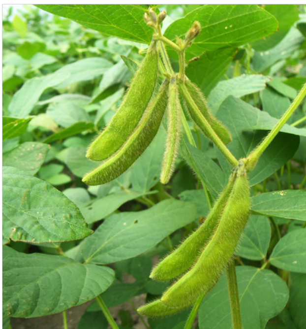
Figure 2 Soybean pod

leading grower and harvests up to 90.6 million tons annually. Each year, a total of 265 million tons of soybeans are harvested worldwide.