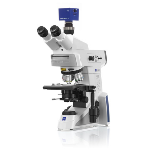
Figure 7 ZEISS Axio Lab.A1

In order to visually detect the sometimes minimal variations between the beans, an upright, transmitted light microscope of suitable quality is recommended, such as ZEISS Axio Lab.A1 (Figure 7).