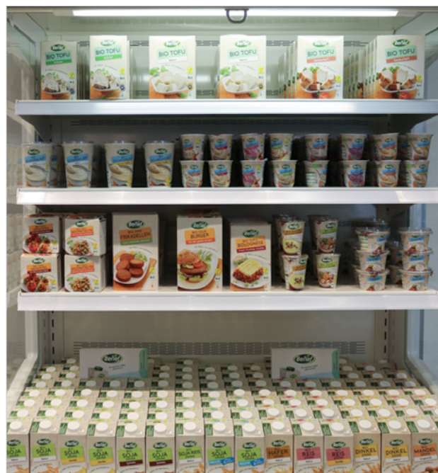
Figure 3 Various soy-based products

At Berief Food GmbH, soybeans are processed into a variety of different soy products, including drinks, soy yogurt, and tofu (Figure 3).