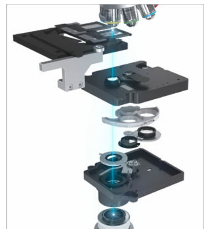
Fully automated polarization components, coupled with high power illumination, allow for unprecedented digitization of petrographic data.