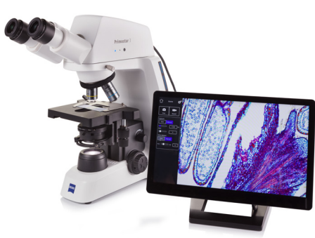
ZEISS Primostar 3 HD

ZEISS Primostar 3 HD (415501-0071-000) with its integrated 8.3 MPx HD Wi-Ficamera is the package of choice for digital classrooms. This camera offers versatile interfaces such as HDMI, Ethernet and USB-C 3.0. Primostar 3 HD is used to view samples on microscope slides with cover glasses, such as stained tissue sections like onion skins, in brightfield.