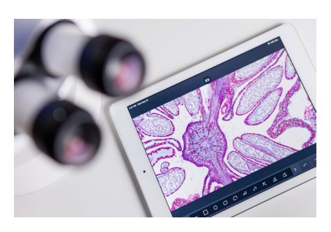
Figure 2 With ZEISS Labscope, annotations and measurements can be integrated into the image acquisition.

Practical exercises make online lessons varied and lively. The ZEISS Labscope imaging app supports practical work with the microscope. Teachers establish a connection between their PC and the microscope so that the microscopic image is visible on the PC or laptop screen. Using Skype, Zoom, Microsoft Teams, or other platforms, this screen can be shared with pupils so that they too can see the microscope image. The pointer function in the ZEISS Labscope imaging app supports remote learning by drawing attention to important points in the sample shown and directing the learners' attention to the selected areas.