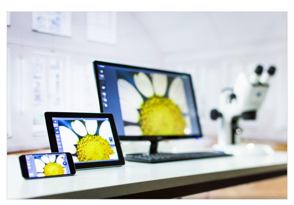
Figure 1 The image seen under the microscope can be transferred to digital media.

Once the pupils have received the image, they can use the drawing function to produce a digitally supported hand drawing of the sample. Hand drawings still play an important role in the learning process. They help refine precise observation skills and aid pupils in assimilating what they have seen. Such a drawing might show, for example, how cells and their compartments are constructed in detail. Working independently allows learners to deepen the knowledge they have gained on the relevant topic – in this case, cell theory.