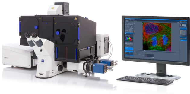
Figure 2 LSM 980 with Airyscan 2 and Elyra 7 dualcam on Axio Observer 7.