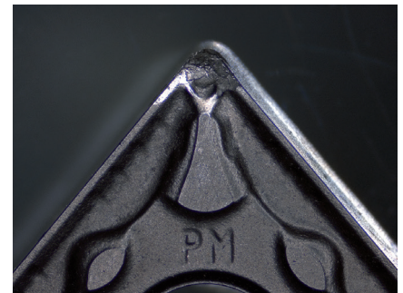
Indexable insert, shows tool wear. Reflected light, ringlight, zoom 0.8x

Stemi 305 is your compact Greenough stereo microscope with a 5:1 zoom – equally at home in the biology classroom, research lab or on the industrial shop floor. Stemi 305 lets you observe samples as they really are: three-dimensional and crisp in contrast – no preparation needed.