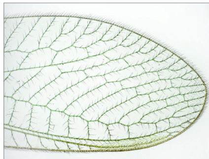
Green lacewing Transmitted light brightfield