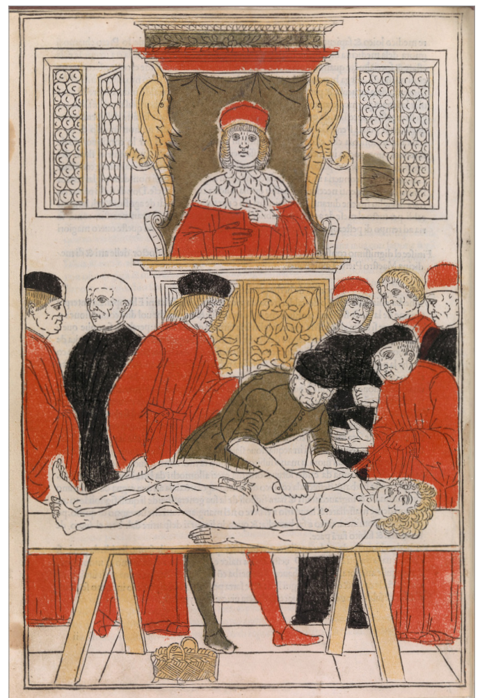
Figure 1 Fasciolo di Medicina , depiction of Anatomy lecture, 1493; https://bodyworlds.com/about/history-of-anatomy/

Even though the opening of corpses was crucial for gaining further knowledge, it came into disrepute with critics coming from church as well as from medical theorists. The dead body could be viewed the dwelling place of the soul, they argued, and