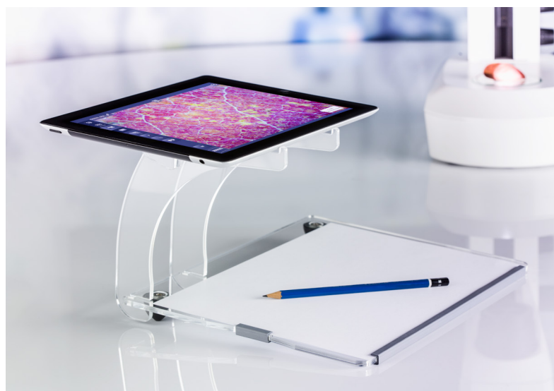
Figure 6 The drawing function of ZEISS Labscope enables the students to draw their microscopy images and easily share and save their results.

Electron microscopy provides information on the structure of mitochondria, myelin, synapses and other cellular components not resolved by light microscopy.