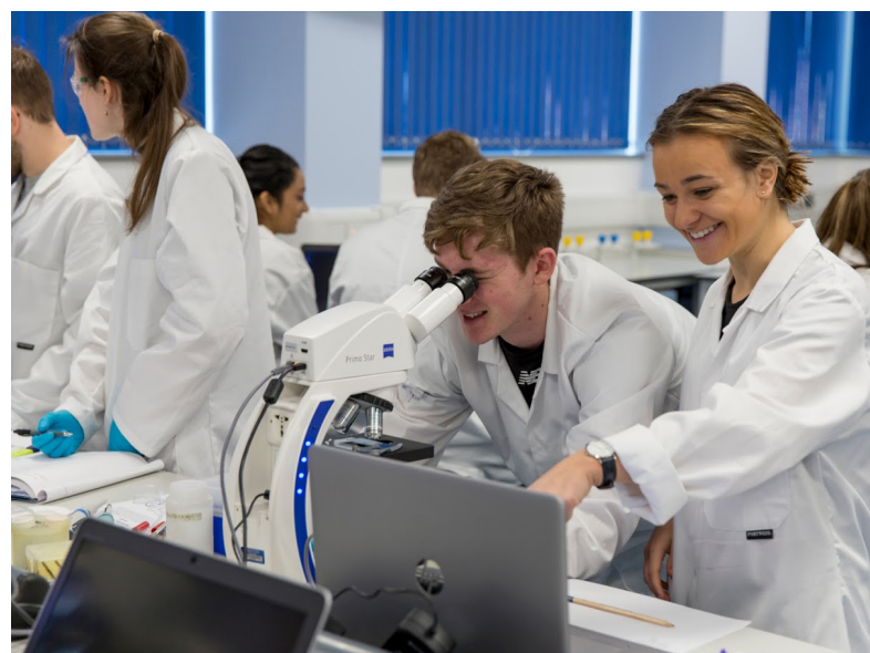
Figure 4 Digital Classroom, University of Exeter, UK

ZEISS now offers versatile microscope technologies to support modern teaching, be it face-to-face, online learning or virtual education. The following chapter describes in more detail the various solutions for teaching and learning in medical education.