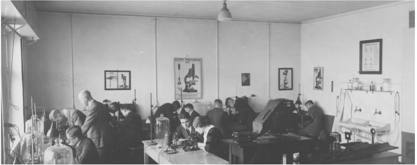
Figure 3 State Optician School Jena: microscopy room, around 1922

enabled Ramon y Cajal, for example, to demonstrate the cellular structure of the brain and nerve tracts. For their work, Santiago Ramón y Cajal and Camillo Golgi were awarded the Nobel Prize in Physiology or Medicine in 1906.