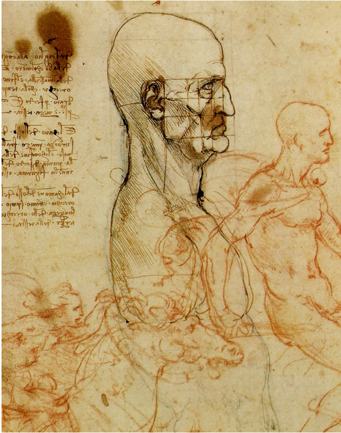
Figure 2 Head study, Leonardo da Vinci

However, curiosity and the thirst for new insights remained and the school of Salerno revived the Alexandrian tradition: anatomical studies could be carried out again. The anatomical act was of great interest to both scholars and the public. During the anathomia, the professor sat in his chair and read from Galen's works while a craftsman or surgeon dissected the corpse. There was not necessarily a direct connection between the lecture and what was revealed on the dissecting table. 4