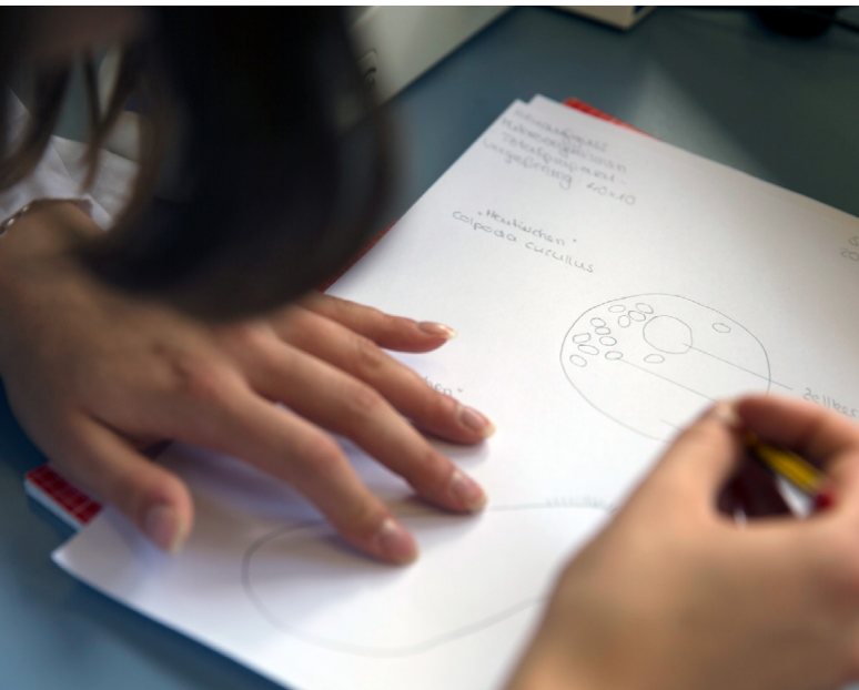
Figure 5 From hand to brain: drawing are still an important tool in education.