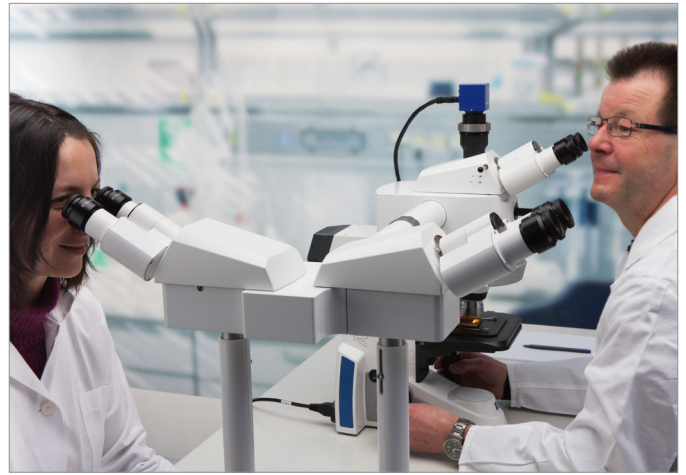
Figure 9 All users of the multidiscussion system see the same image.

Under Covid-19 restrictions, school and university closures led to a re-evaluation of digital teaching and learning. In many places, teaching content was delivered via the Internet, with the use of tablets, smartphones and PCs as well as e-learning tools and online platforms. In online live teaching, educators and learners work together simultaneously and synchronously in a teaching call. This provides the opportunity for direct interactive communication. Online live teaching for remote learning is also possible in microscopy-based education and practical exercises on a microscope can make online lessons varied and lively. ZEISS enables live teaching online with camera-ready microscopes and Labscope, the educational software. Teachers establish a connection between their PC and the microscope’s camera so that the microscopic image is visible on the PC or laptop screen. Via Skype, Zoom, Microsoft Teams or other