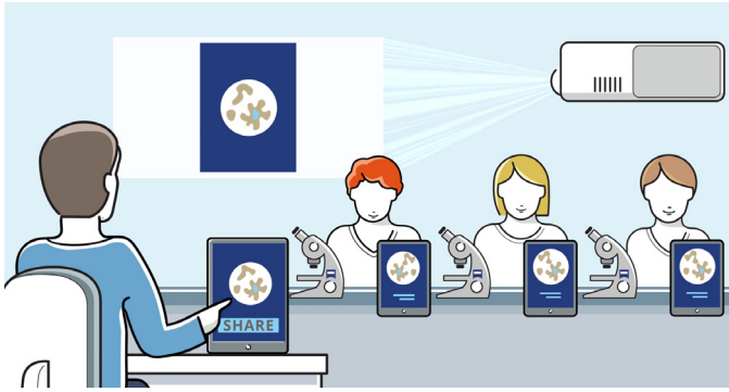
Figure 7 ZEISS Labscope Teacher puts the lecturer in charge of all connected microscopes in the network of the digital classroom.