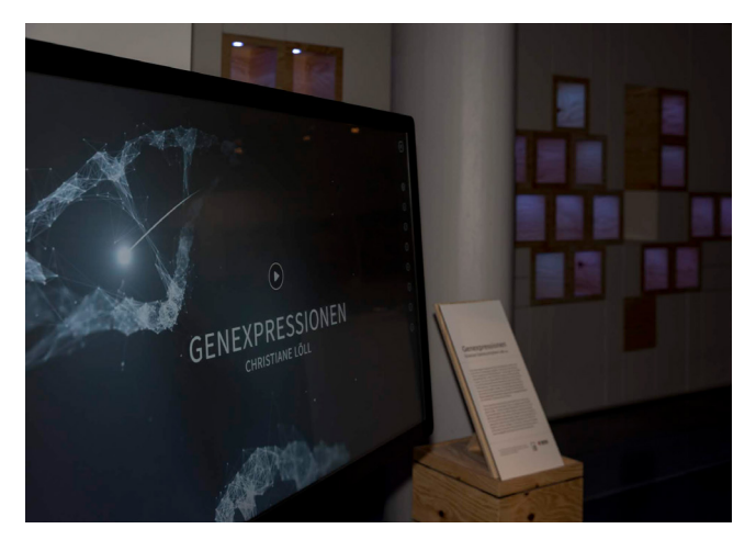
Figure 1 Topics from the field of life sciences play a major role in the center.

Since 1979, Ars Electronica has been searching for the interfaces between art, technology, and society. The center describes itself as a museum of the future where fusions of art, science, and technology are displayed and developed. Visitors can choose to perform experiments in the fields of biotechnology, genetic engineering, neurology, robotics, prosthetics, and new media art, as well as learn about how we will communicate in the future and what these changes mean for us and our society. In 2009, the center was expanded in the run-up to Linz's year as the European Capital of Culture, and its contents and exhibitions were tailored to focus on the life sciences (figure 1).