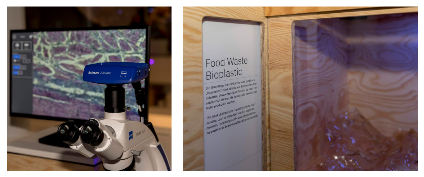
Figure 6 "You never know whether you're just a drop in the ocean or the drop that causes the barrel to overflow," says Gerfried Stocker regarding sustainability. Sustainable materials can be investigated using ZEISS microscopes.

For precisely this reason, the Ars Electronica Center also has a fully equipped BioLab (figure 7) with an S1 security level. As part of workshops and guided tours, visitors can make the smallest biological structures and processes – such as those of a cell – visible. In the BioLab they can research CRISPR/Cas9, the isolation of DNA, the cultivation of cell cultures, and other investigative methods from different areas of biology.