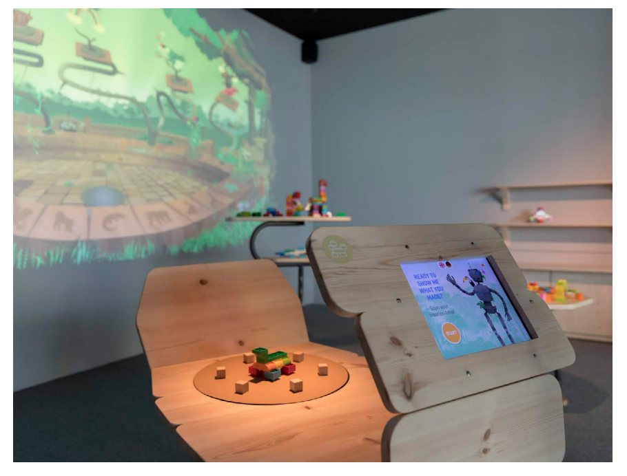
Figure 3 In the children's research laboratory, children aged four and up can build Lego animals that the computer program recognizes and brings to life in a virtual zoo.

The Ars Electronica Center doesn't want people to see the laboratory as a detached work cell. In order to discover and shape the world, it is important for the laboratory to be an integrated element and a connective hub for creativity, technology, society, and science. To this end, the Ars Electronica Labs (figure 5) cover four thematic areas. In the CitizenLab, visitors can explore how every individual can make their life sustainable (figure 6). The SecondBodyLab