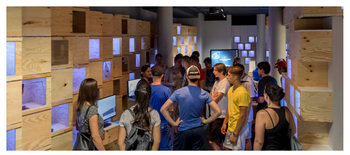
Figure 4 The topics covered by the Ars Electronica Center are integrated into the school curriculum.

focuses on the human organism and the processes of life that take place at the cellular and molecular levels. Current scientific methods allow us not only to observe and visualize biological processes but also to intervene in them in a variety of ways.