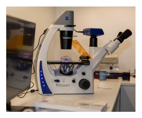
ZEISS Primovert iLED