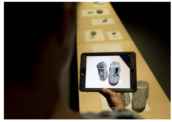
Figure 2 Interactive stations invite to exciting and inspiring excursions into the future fields of artificial intelligence and neurosciences as well as geneand biotechnology.

The Ars Electronica Center doesn't just deal with these topics on a theoretical level. The FUTURELAB is the museum's research and development center. Approximately 40 developers work together with leading international industrial companies on self-driving cars, robot vacuum cleaners, robot mops, and more. Prototypes that are produced here are then put into distribution by the cooperation partners. "The greatest challenge is keeping up with the latest technological developments," says Gerfried Stocker, Artistic Director. "A few years ago, the first and only 3D printer in Upper Austria was here at the Ars Electronica Center. Today, the focus is on artificial intelligence (figure 2)."