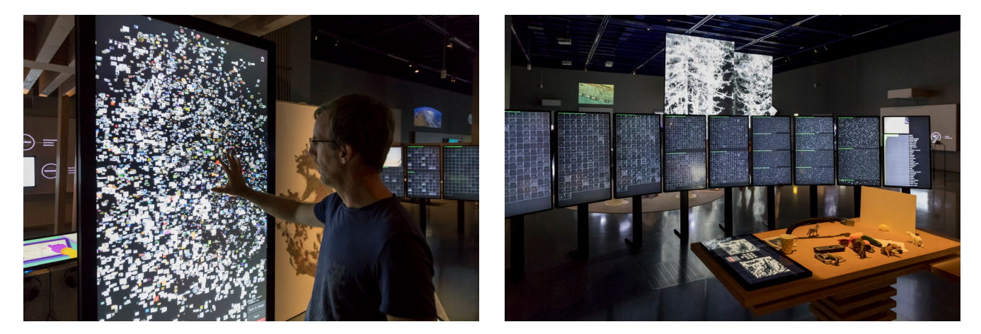
Figure 9, 10 The Ars Electronica Center in Linz offers interactive stations, works of art, research projects, large-scale projections, and laboratories for every age group.