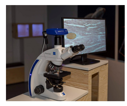
ZEISS Primo Star