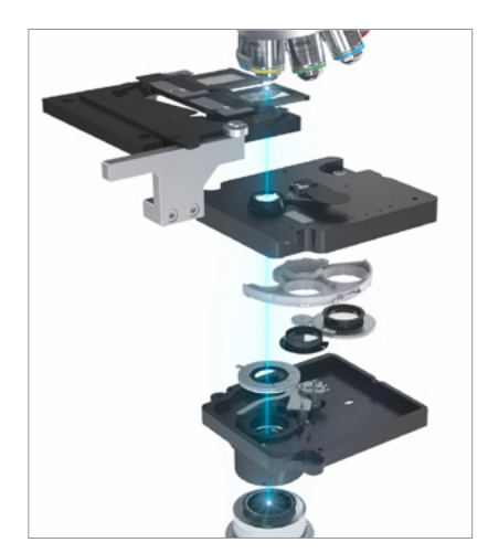
Fully automated polarization components, coupled with high power illumination, allow for unprecedented digitization of petrographic data.

The new high power VisLED is 4X more powerful than previous systems, allowing for high-speed continuous data acquisition even in polarization illumination modes.